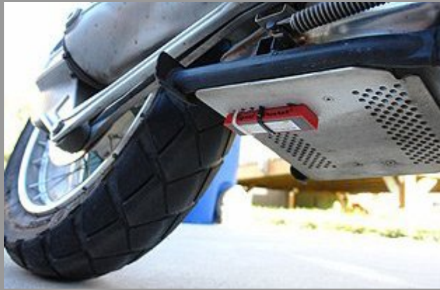
Photo shows an installed G-4 2.

Note: The provided two-sided tape is a permanent industrial adhesive that will bond immediately, but not fully cure for 24-48 hours – depending on temperature. Mounting Signal Sorcerer® is therefore suggested when you know you will not be operating your vehicle for several hours. If you wish to install your unit and operate the vehicle immediately, it is suggested that you use masking tape or a twist tie to temporarily assist the adhesive during curing. The assisting material may be removed after the curing period is completed.